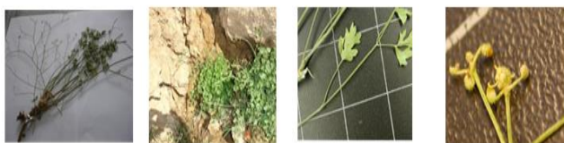
a. Whole dried plant Fig.1. Pimpinella boisseiri b. leaves. c. flowers

The fresh roots of this species are chewed and eaten by the local people for their calming and aphrodisiac effects. Since there is almost no information on this particular species, we may be the first to examine this species for its chemical composition. Based on the above, the roots of Pimpinella grown in the wild, were collected from Qaradakh mountains – Sulaimai for investigation.